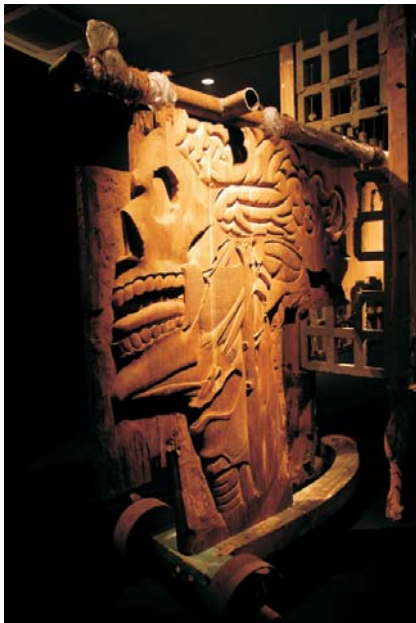
RIYAS KOMU - Oils Well, Let's play (detail) 2007 wood, iron, canvas - 266.7 x 383.5 x 89 cm.

such feelings and sensations that Studio la Città has chosen six artists to show in the gallery's new spaces: Hema Upadhyay, Ashim Purkayastha, Nataraj Sharma, Riyas Komu, Shilpa Gupta, and Valsan Koorma Kolleri. Some of them already have an international reputation, having taken part in important fairs and exhibitions; their work is also represented by various galleries. But with this show, carefully balanced as it is in its choice of Indian artists from the international art scene, Studio la Città aims at underlining its own taste, its own preference