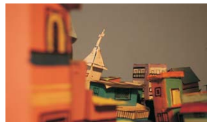
HEMA UPADHYAY Killing Site (diptic) - 2008 183 x 244 x 61 cm.

STUDIO LA CITTÀ · LUNGADIGE GALTAROSSA 21·37133 VERONA