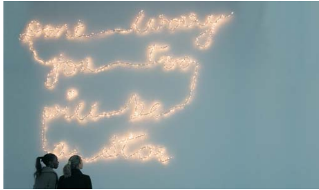
SHILPA GUPTA - Don't worry you too will be a star - 2007 - varnished metal structure and electric lights - 401.3 x 500 cm.

What should be our approach to an artistic culture that was virtually unknown to us until just a few years ago? Our enthusiasm for India, or China for that matter, comes from the sense of novelty these countries, these artists and their art give us. We find ourselves almost in the situation of an explorer or a pioneer, enthusiastic for discovery. It is with