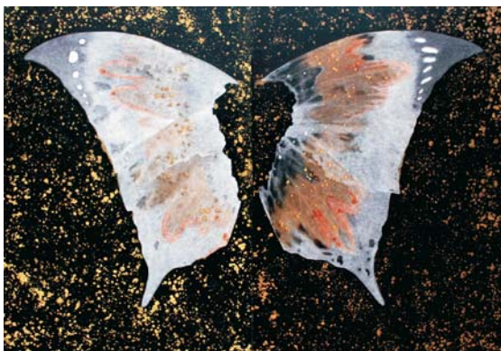
ASHIM PURKAYASTHA - Wings with black watermarks - 2007 acrylic on canvas - 228.6 x 317.5 cm.

tradition, social contradictions, together with a forward-looking attitude, seem to be mixed chaotically and understood only with difficulty by a "Western" eye.