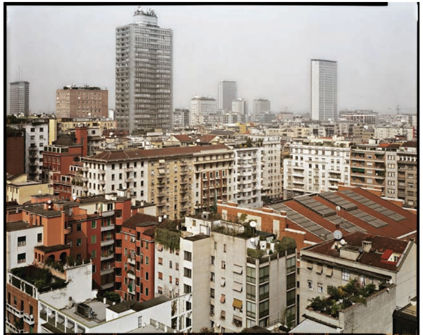
Milano, 2007 - C-print - 180x225 cm

2003 Buildings , Fondazione Sandretto, Re Rebaudengo, Torino Nieuw werk , Galerie Paul Andriessse, Amsterdam ACF - Amsterdam Centre for Photography, Amsterdam Le Case d'Arte di Pasquale Leccese, Milan Campi di Colore , Palazzo Bagatti Valsecchi, Milan Paysages , Abbaye Montmajour, Arles Solo , Palazzo Re Rebaudengo, Guarene d'Alba, Cuneo